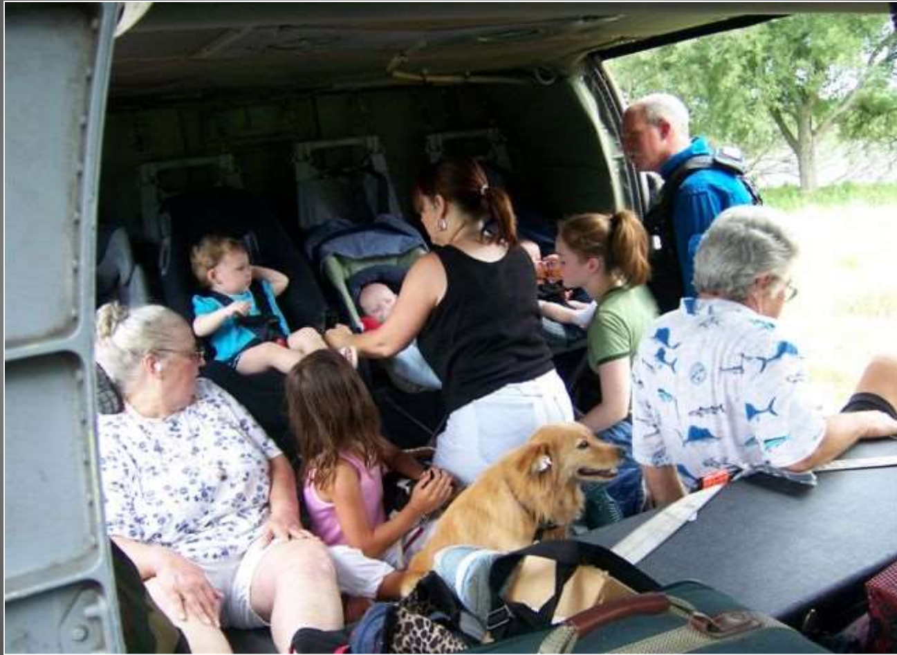
Air Evacuation, Texas Floods, June, 2007