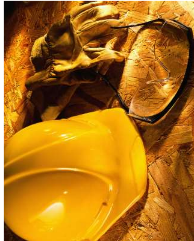
Proper Equipment & Plan